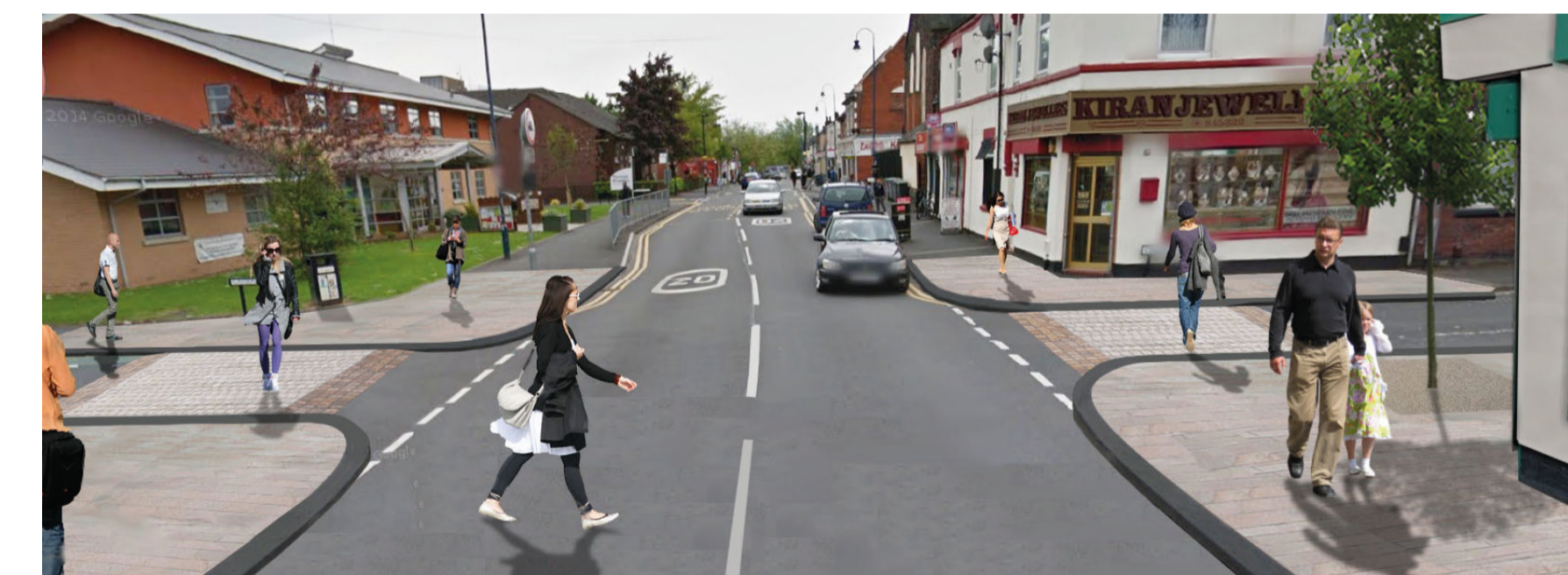
Proposed Layout: Shelton Village

All proposed waiting and loading restrictions will be subject to future consultation.