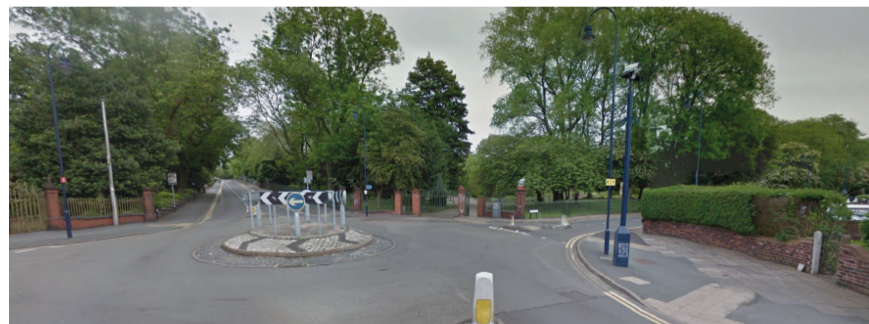
Existing Layout: College Road / The Avenue Junction