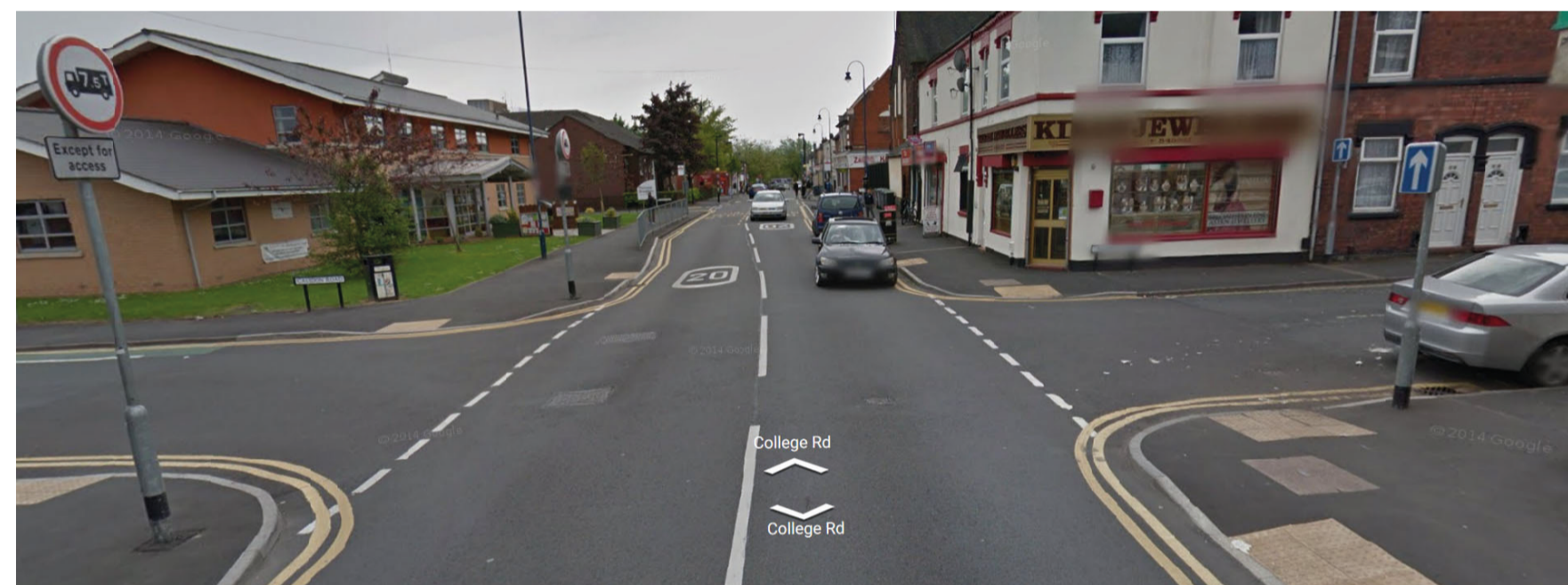
Existing Layout: Shelton Village