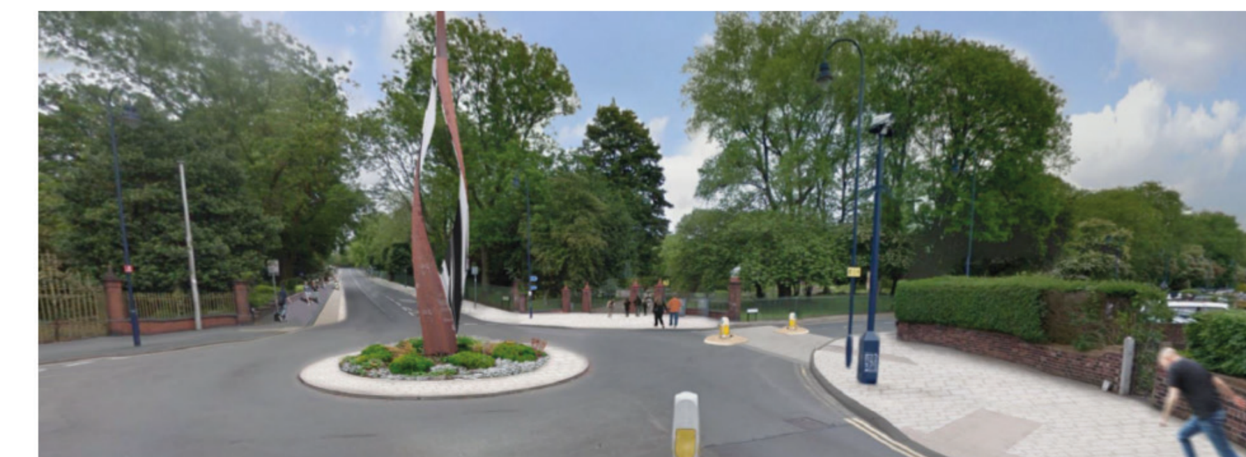
Proposed Layout: College Road / The Avenue Junction